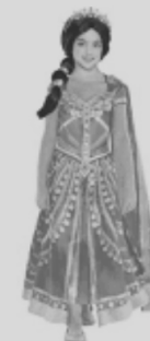
SAMPLE- not actual costume