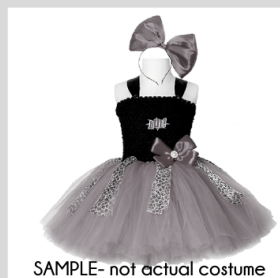
SAMPLE- not actual costume